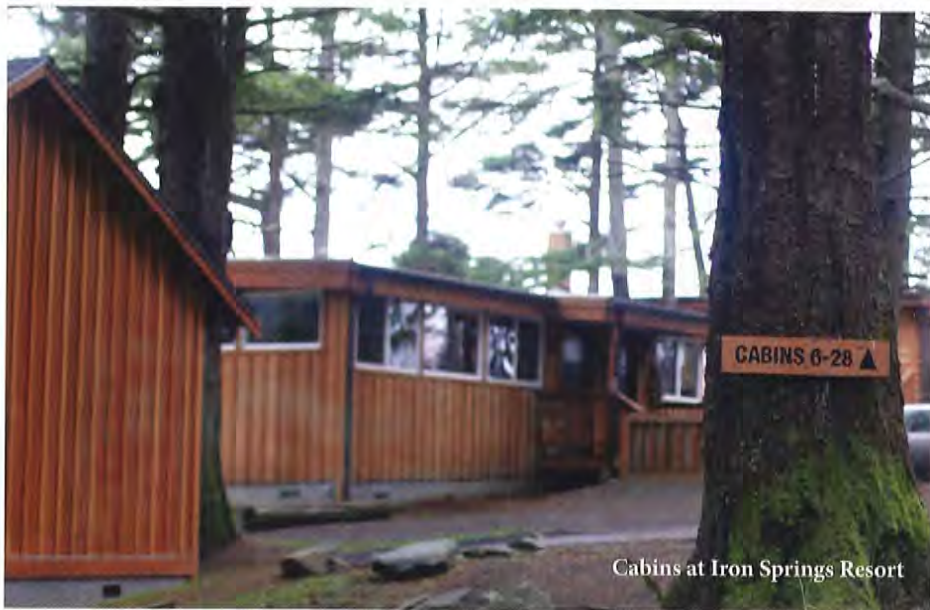
Cabins at Iron Springs Resort

yards, where you can roast marshmallows and hang out.