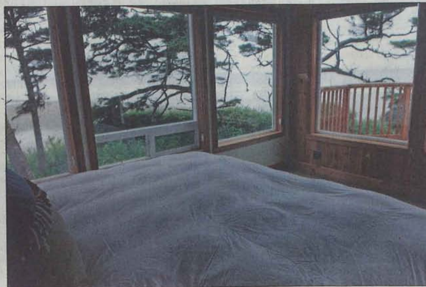
MACLEOD PAPPIDAS | THE DAILY WORLD

"I think our experience is a lot different than Seabrook's, but there's something for everybody up here."