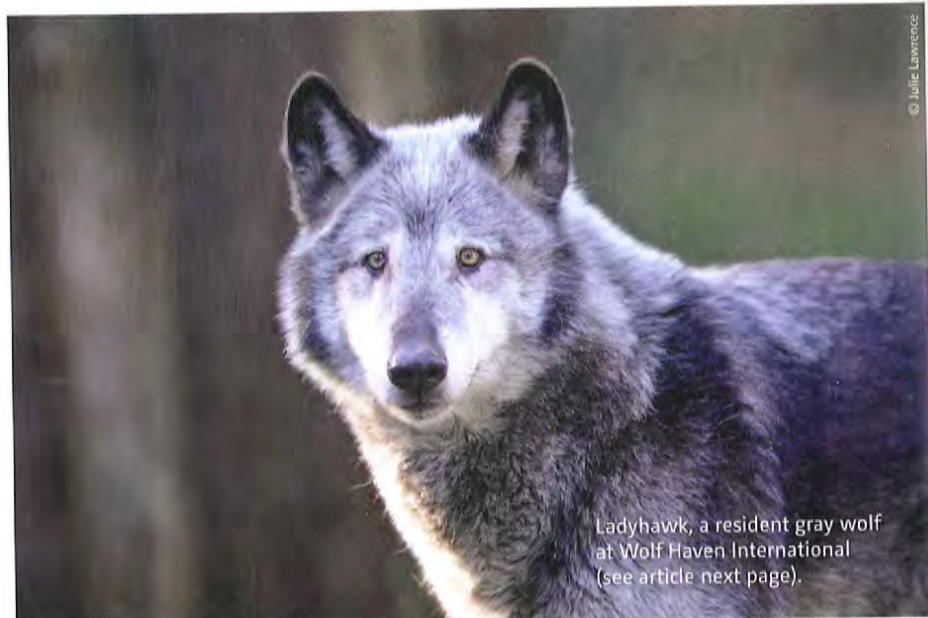
Ladyhawk, a resident gray wolf at Wolf Haven International (see article next page).

On-season or off, it's still a place where new memories are born and old ones recalled. www.ironspringsreservations.com , (800) 380-7950.